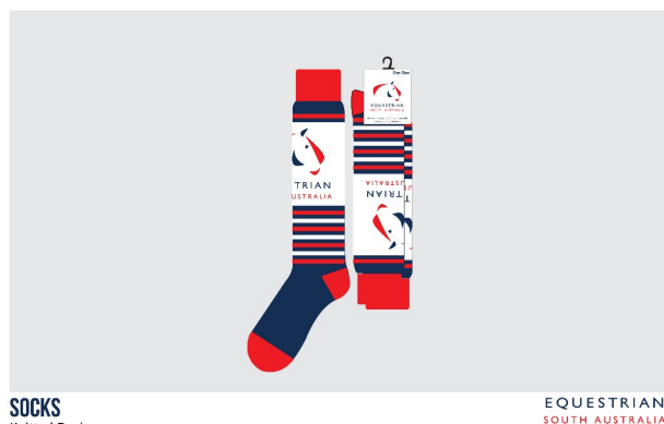
Picture 2 Team SA socks