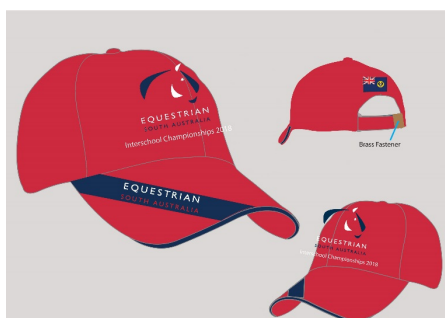
Picture 4 Team SA Cap