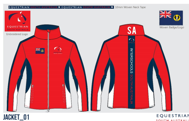
Picture 1 Softshell Jacket