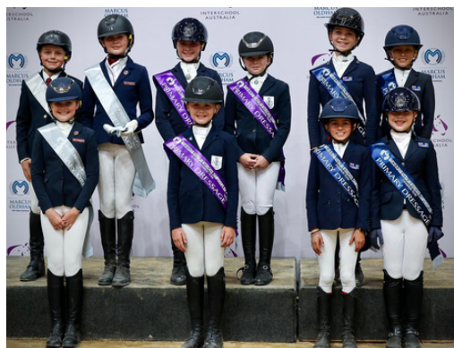
SA's winning & placing aggregate teams.