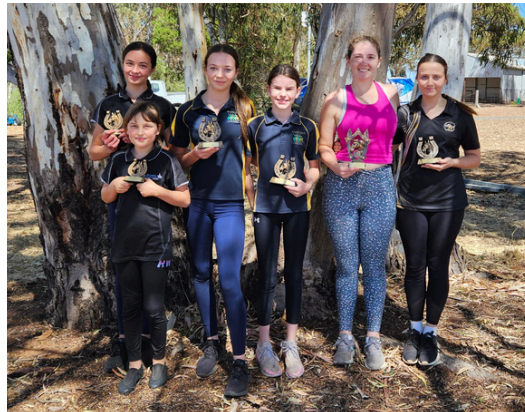
Participant Award winners