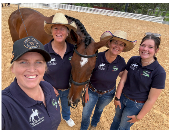
Above: Noella Angels Team photo at Willinga Park Dressage by the Sea CPEDI

We wish to send our appreciation out to each of the clubs and the volunteers behind those clubs for their hard work, not just for para but for the whole dressage discipline. It is tiring work and many riders forget to thank the volunteers who work so hard, so from the Para community we thank you for hosting such great events and for creating inclusion by including Para Dressage competitions. We understand Para is still a new concept, with more support and development needed. There are learning curves around each corner, and we believe the volunteers have done a great job of tackling each one. The DSA Committee is learning more and is working hard on imparting knowledge regarding Para.