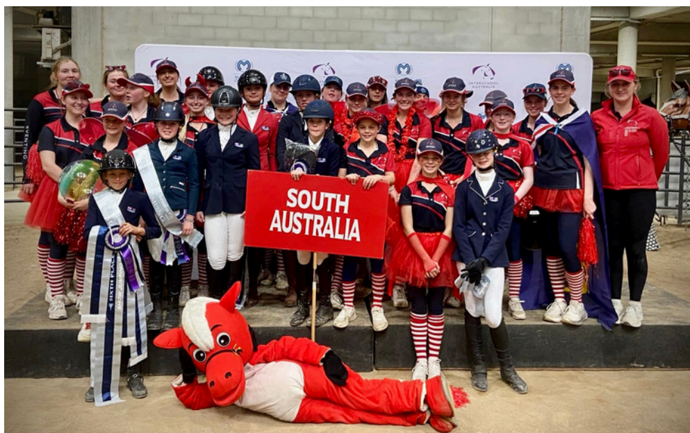
A very proud Team SA!