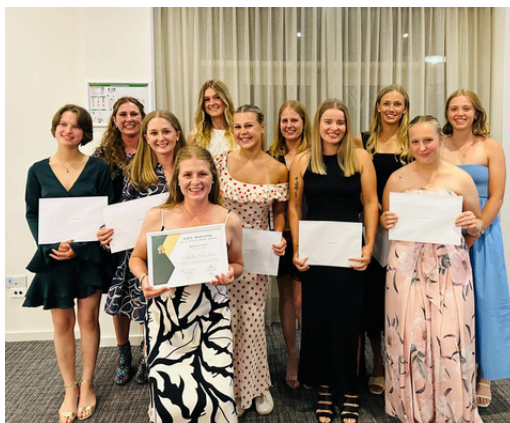
The 2023 Gillian Rolton Youth Development Award Finalists.