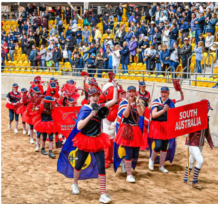
Team SA at the Opening Ceremony.

This year's National Championships was hosted by Interschool Queensland at the Australian Equestrian and Livestock Events Centre (AELEC) in Tamworth for the first time and was an amazing experience for our riders.