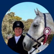
HOTY & MEDALS